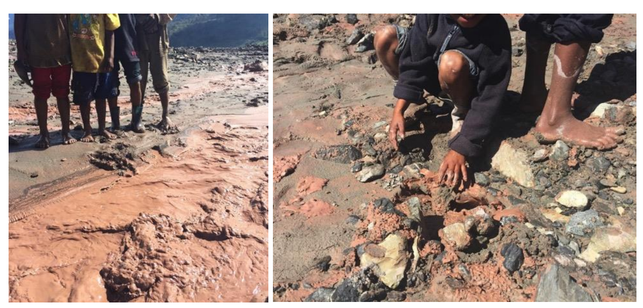
Photo 16 (above, left): Children play in the Red River. Photo 17 (above, right): Children playing by the Red River, the water's residue evident upon their skin.