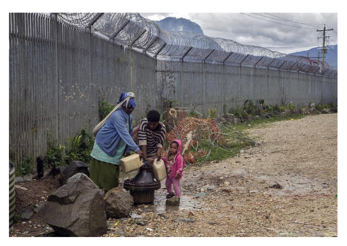
Photo 20: A family collecting water from the pressure valve at Kulapi, directing the water by hand.

Direct access to Waile Creek Dam itself is largely limited to the few Porgerans who can access vehicles, as it is approximately 15 kilometers from the SML. "Only those with vehicles go to Waile Creek. They collect water for their families, and any extra they sell," explained a man from Mugalep. 51 Some interviewees also expressed concerns about collecting water directly from Waile Creek. A woman from Alipis told us: "Waile Stream isn't our land. If we go, someone might chop our necks."275