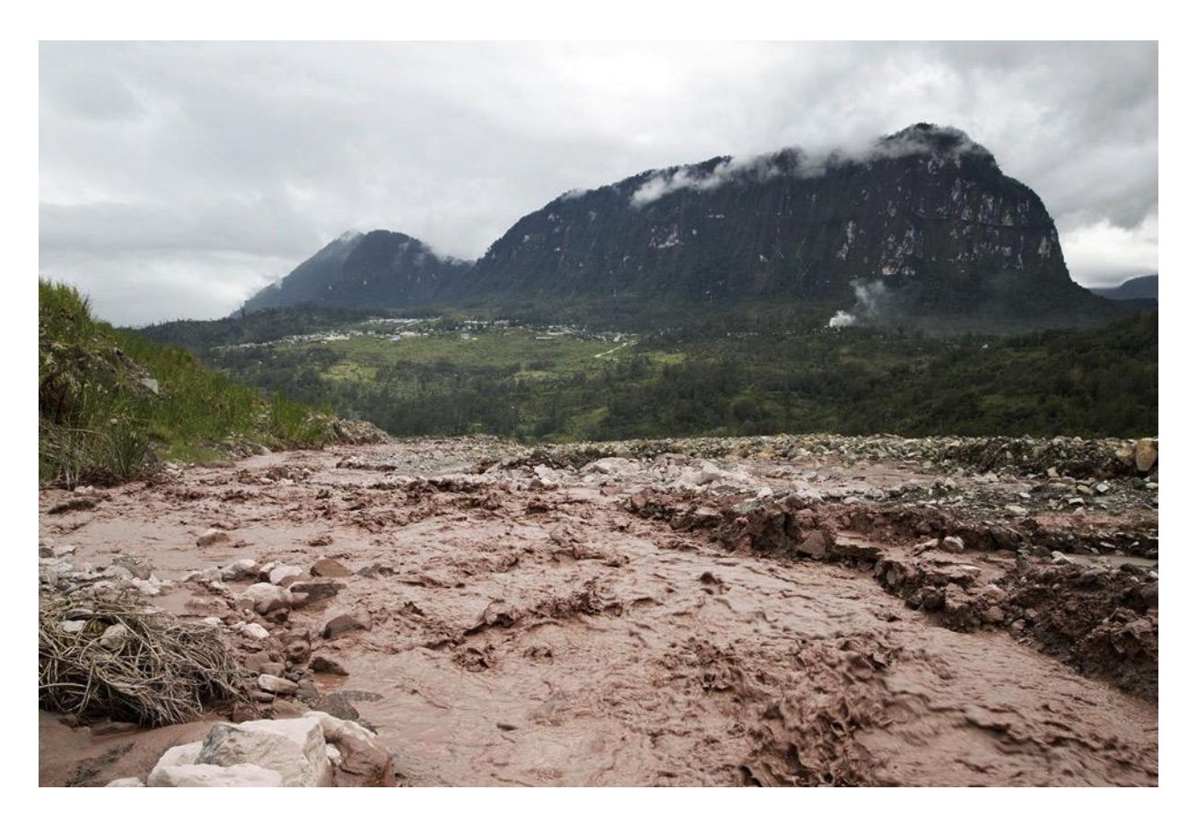
Photo 15 (above): The Red River is a vibrant red against the lush green of the Porgeran horizon.