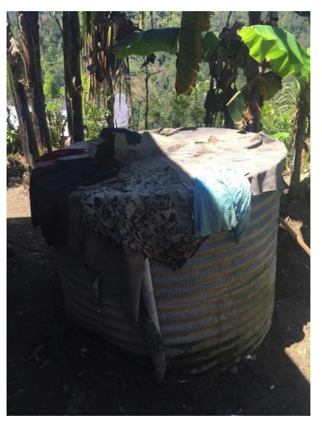
Photo 4 (above, left): One barrel's label reveals its past use as a storage container for Hydrochloric Acid. Photo 5 (above, right): An old metal tank no longer used for water storage. Photo 6 (below): Homes near the mine do not have running water inside them. This woman has brought her dishes to a Tuffa tank to wash them.