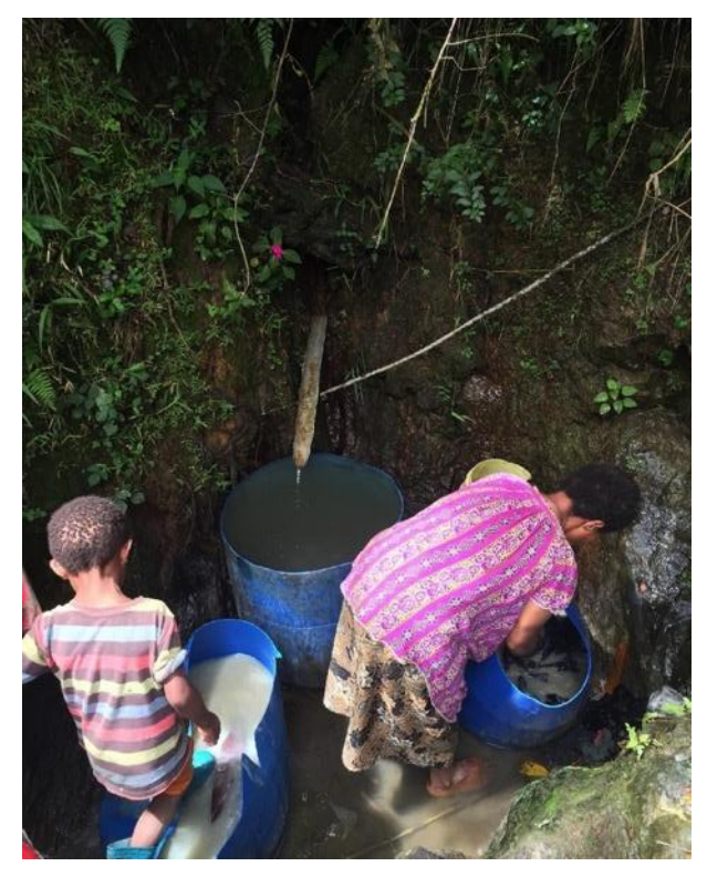
Photo 13 (above, left): Men gather by a local spring, funnelled from a pipe. Photo 14 (above, right): Washing with spring water, it can take significant time to collect adequate water for this task.