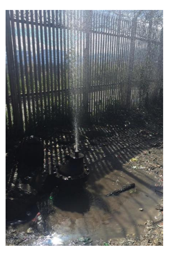
Photo 21 (above, left): Attaching a hose allows this resident to direct the flow of water from the pressure valve at Kulapi. Photo 22 (above, right): The pressure valve at Kulapi shoots water straight into the air unless residents improvise collections methods (See Photos 20 and 21). An entire village relies heavily on this one source. Photo 23 (below): A young boy stands beside a pressure valve for a pipe channelling water from the Waile Creek dam.