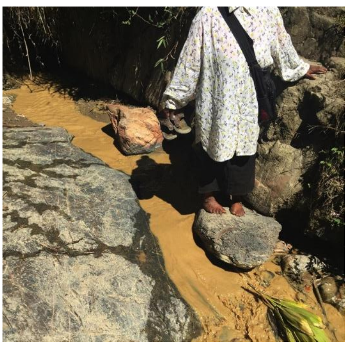
Photo 10: Many creeks in Porgera have a gray or brown color. Residents often fear such creeks to be polluted by the mine or by upstream use.

As described in the Methodology chapter of this report, water chemistry can vary at a given site according to changes in