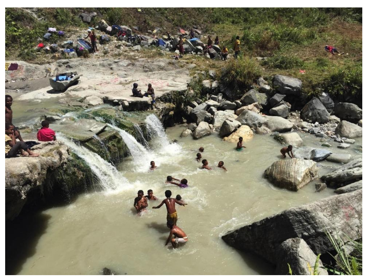
Photo 18: Children play and families wash their clothes in the Kakai River near Alipis village.

The mine's tailings waste (the "Red River") flows first into the Pongema River, which flows from the south to the north. The tailings and Pongema then join the Kaiya/Anjolek and Kakai to form the Lower Porgera River.