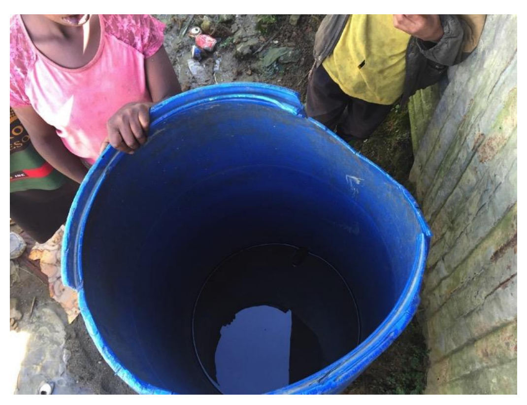
Photo 3: Children stand by their blue barrel, now almost empty of water.

Prolonged low rainfall also adversely impacts Porgerans' ability to cook and thus access adequate food. "[W]e need water to cook so we eat biscuits instead of cooking food," explained a woman from Mugalep, describing how low rainfall affected the food she and her family ate. A woman from Panadaka similarly reported: "If we don't have water to drink or cook, we go to the shops, buy coke and a scone."61