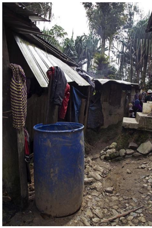
Photo 8 (above, left): One family has tried to improvise a screen to keep debris out of their blue barrel. Photo 9 (above, right): Blue barrels are typically found under roofs in order to best collect rainwater run-off.