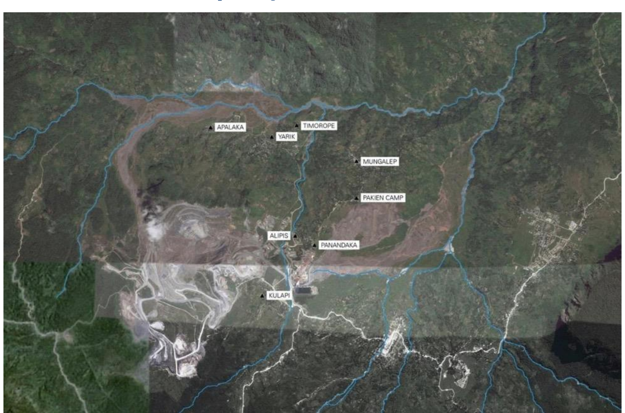
Map 1: Villages in and around the mine

Porgerans' lack of adequate information about water resources, and the failure of corporate and state actors to conduct sufficient outreach to communities, has led to a general feeling of insecurity and fears of adverse health impacts. The failure of the mine to effectively respond to communities' uncertainties has engendered feelings of distrust and a sense of helplessness about the prospect of an improved standard of living.