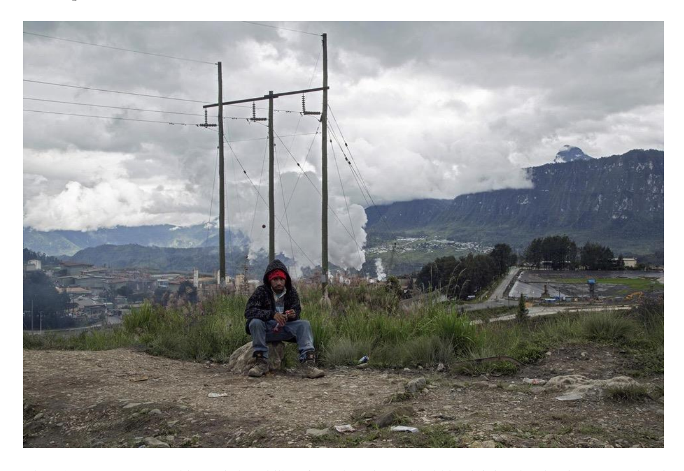
Photo 7: A man rests as white emissions billow from the mine behind him, joining the cloud cover overhead.

Those living closest to the mine's mill, including residents of Kulapi and Panadaka, express particular concern about rainwater pollution. "The mine produces smoke just below the clouds and when the cloud comes down in the rain, the smoke becomes part of the water I drink," observed one woman from Panadaka.65 "We think when it comes down, it comes down with the chemicals, so we are drinking chemical," explained another resident. One man from Alipis stated that he refused to drink rainwater out of his blue bin at all because of this perception of smoke "coming down as rain."67