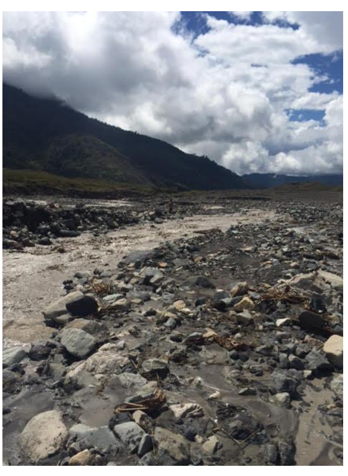
Photo 19: The Anjolek River flows down from the Anjolek dump, later joining the Kaiya River.

Many residents of Alipis readily access the Kakai River, generally using it for swimming. washing and Panadaka residents also access the Kakai, although it is at least a 10 to 15 minute walk from the center of the village.<sup>25</sup> Yunarilama residents access the Kakai further downstream. Pakien Camp and Mugalep residents face longer traveling distances, making the trek difficult for residents carrying dishes and clothes to be washed, and therefore use the Kakai less often. Residents of Apalaka, Timorope, and Yarik are closer to the Kaiya, which they