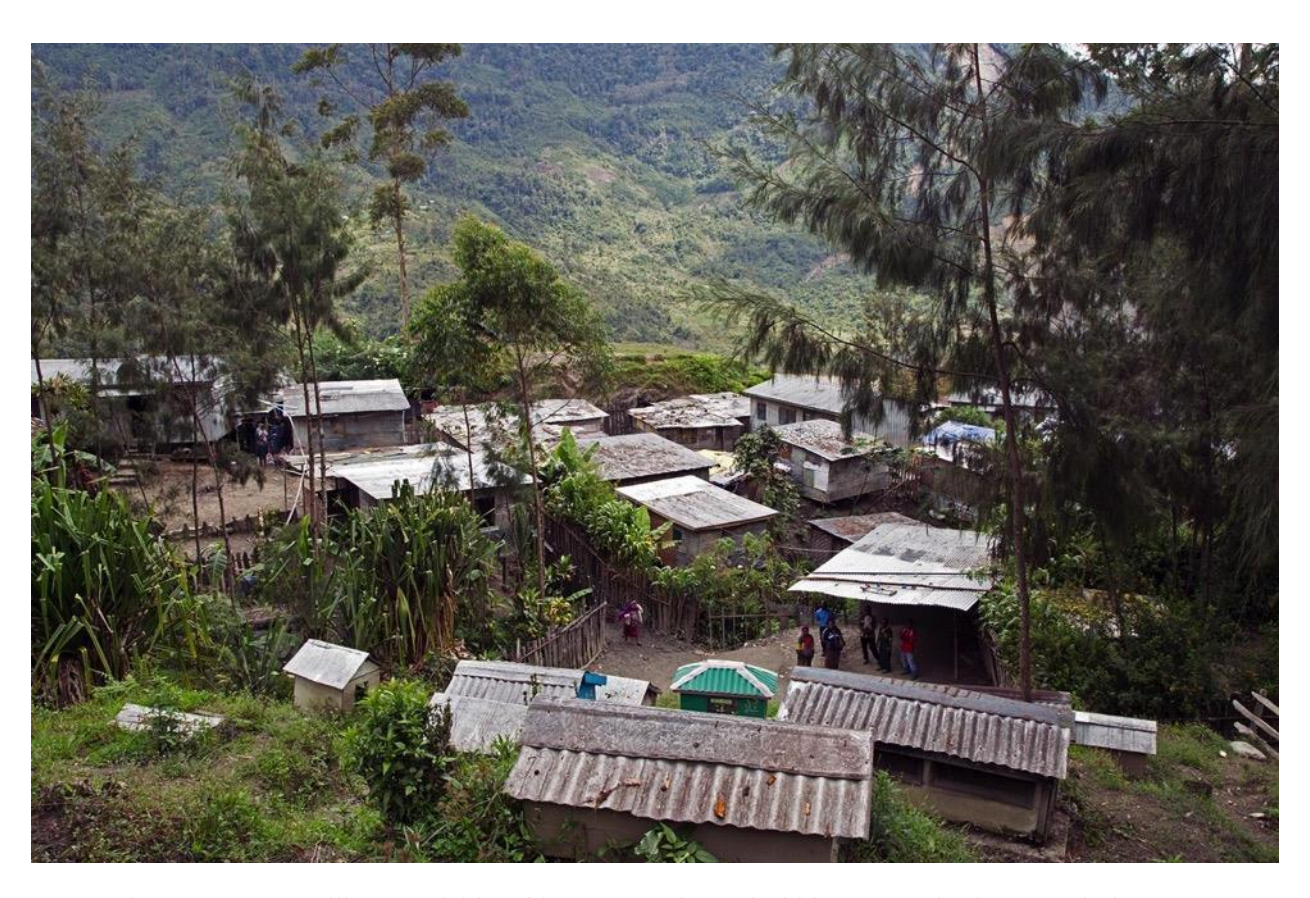
Photo 1: In most villages, neighbors' homes are situated within extremely close proximity to one another, with little space for agriculture or latrines.

Community members are concerned about the crowding of multiple generations of families into small homes. Without land to move onto, numerous families are concentrated in small areas, and more people are forced to share living spaces than would traditionally be the case.<sup>12</sup> This can contribute to familial conflict,18 and exacerbate concerns for health and hygiene. Many live with their entire extended families-grandparents, parents, children, in-laws, cousins-all sharing a few small rooms." Depending on a variety of factors such as village location, economic resources, and status, families may live with ten, fifteen, or more family members, sleeping in every available space<sup>15</sup> of homes of one or two small rooms. <sup>16</sup>