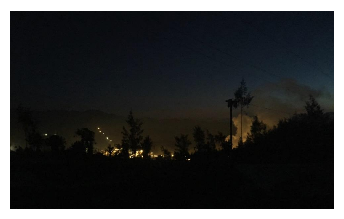
Photo 2: In the distance, the mine's lights can be seen. Operations often continue throughout the night, interrupting the quiet of the surrounding landscape.

In addition to blasting and landslides, residents are impacted by persistent and loud sounds emanating from the active mine. In numerous villages, the sound of clamorous trucks and other vehicles operating throughout the day and night can be heard, which disturbs residents' sleep, conversation, and study. These concerns are particularly pronounced for those living in villages close to Anawe dump and the pit areas, in particular Panadaka, Pakien Camp, Alipis, and parts of Kulapi. For some residents, the noise is so disruptive to sleep and study that they have sent their young children to other villages to live.