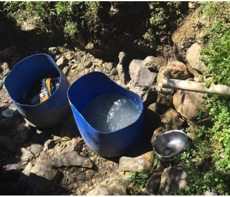
Photo 11 (above, left): A woman collects spring water from an improvised leaf sprout, inserted into the side of a hill. Photo 12 (above, right): The washing has been gathered at a spring source, rather than transport water back to the home.